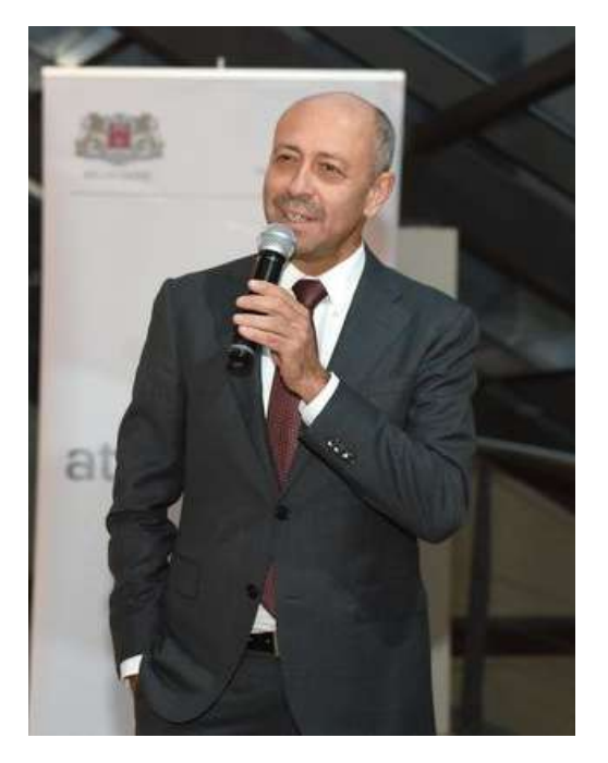
Vilnis Kirsis "Vienotiba" Candidate for Mayor of Riga Candidate for Mayor of Riga