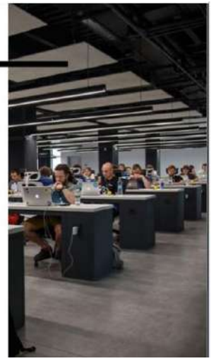
Finansēs mācības pakalpojumu eksporta nozarē

AKTUĀLI + Sports mūs vienoj + Kāpēc man tas jāzina? + Atgriežoties mājās + Banku biznesa anatomija • Jaunais koronavīruss. + MELU TVERTNE: Informē par viltus ziņām