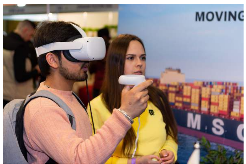
Career days at RTU

At National Shadow Day pupils from various Latvian schools were welcomed at the company, getting an immersive experience into the shipping industry and its diverse professions through engaging activities and virtual reality experiences.