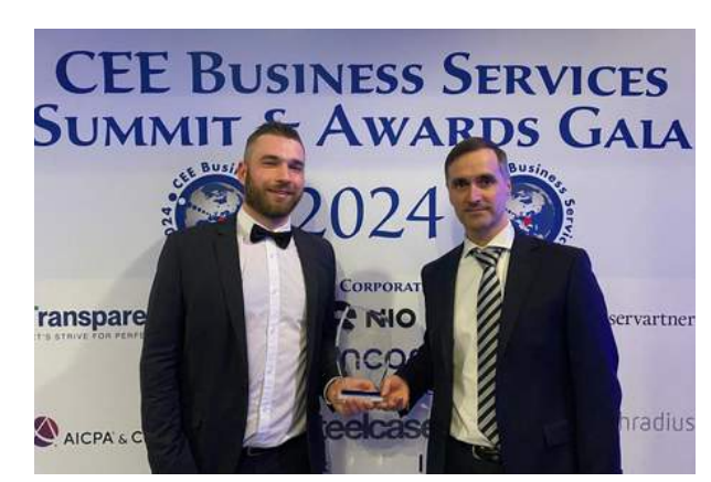
Receiving the award "Most Vibrant Employer in Latvia"