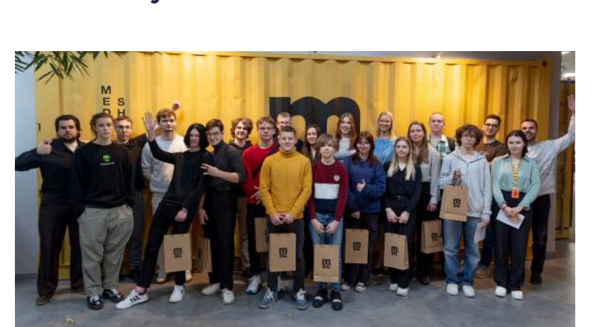
National Job Shadow Day